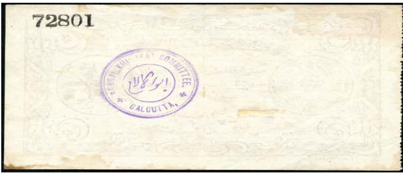
"Khilafat Movement Receipt"243

"Khilafat Movement Receipt"