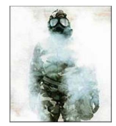
Figure 9. Lighter, Breathable Uniforms

By changing the properties of materials, such as by introducing tiny nanoparticle reinforcements into polymers, nanotechnology will enable such advances as making helmets 40-60% lighter and creating tent-fabric that repairs itself when it rips ("BBC News", 2012).