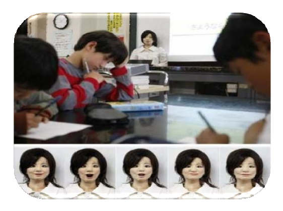
Figure 2. Teacher Robot 'SAYA'

First developed as a receptionist robot in 2004, SAYA was tested in a real Tokyo classroom earlier this year with a handful of fifth and sixth graders, although it still can't do much more than call out names and shout orders like "Be quiet" ("The Indiana Gazette", 2009).