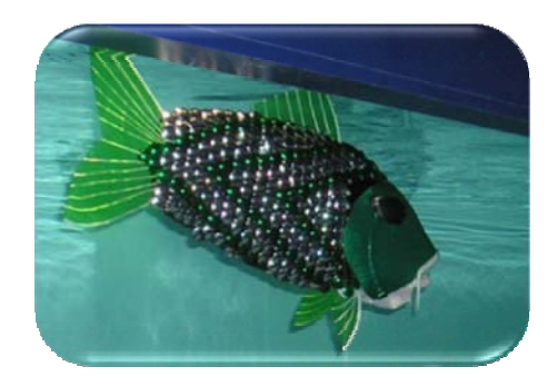
Figure 5. Robot Fish

effective, and maneuverable than the propeller-based propulsion. The aim of our project is to design and build autonomous robotic fishes that are able to reactive to the environment and navigate toward the charging station. In other words, they should have the features such as fish-swimming behavior, autonomously navigating ability, cartoon-like appearance that is not-existed in the real world ("Human Centered Robotics Group at Essex", 2010).