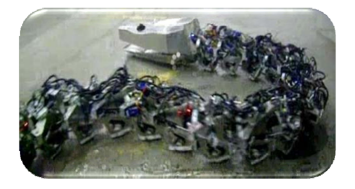
Figure 8. Robot Snake: Titanoboa

The Titanoboa project is an exercise in alternative forms of propulsion and power applications in transport. The purpose is to showcase this experiment by harnessing and enlarging the mesmerizing movement of the snake. The huge serpent has undeniable appeal as a surreal mechanical beast that moves in a seemingly magical way over land and will glide stealthily through the water. One or more participants will eventually interact with the piece by riding it or for the more ambitious, driving it. The complex control needed to properly move hundreds of individual parts will necessitate a skilled operator who has taken time to become at one with the serpent ("Mashable Tech", 2012).