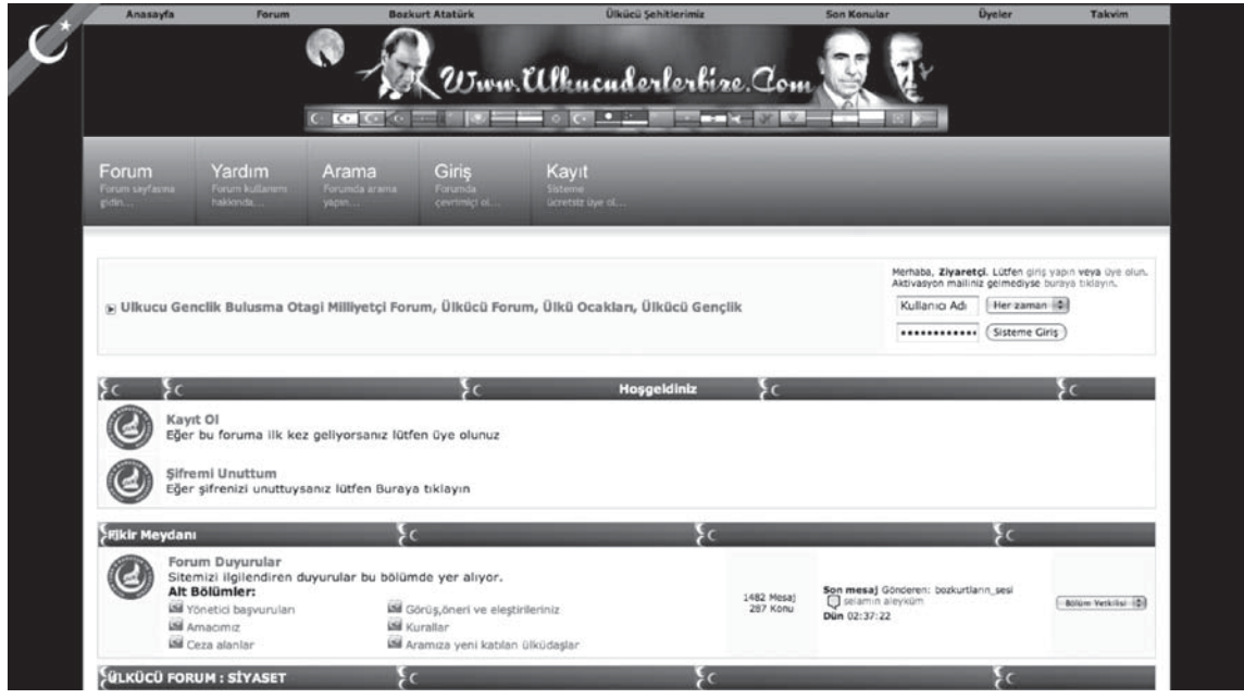
Picture 1 Visual Layout of a Nationalist Forum Site Decorated with Nationalist Symbols

According to Horton (2008), good design depends on creating a hierarchy of contrast and viewer attention, so that a few focal areas of the page become entry points and the other page materials are clearly secondary. Our analysis showed that tools like manageable headline areas were used as primary visual entry points in most of the sites. However, the intention does not seem to be to provide a consistent user experience, but rather to promote certain ideas through the visual entry points in the layout. As a typical example, the news headline bar in the "gok-turkler.net" is located at the middle of the homepage as a visual entry point big enough to be unavoidable (Picture 2).