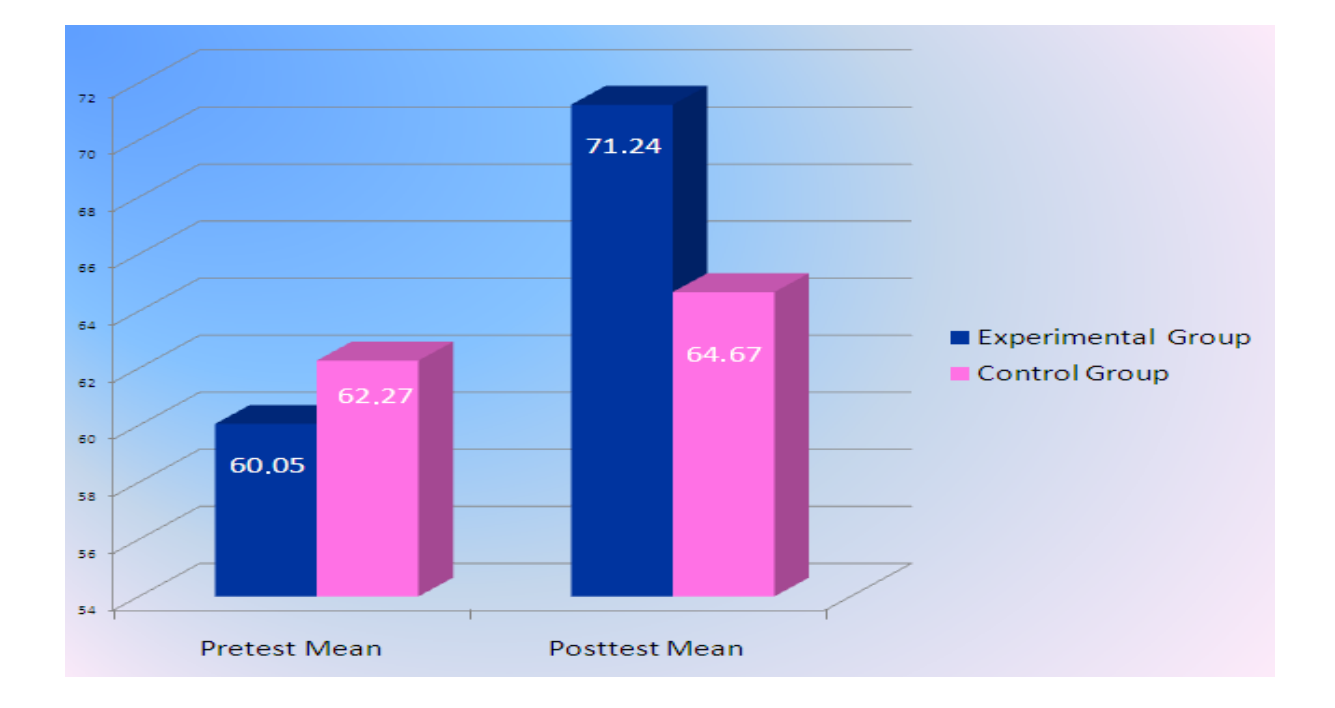
Figure 1: Comparison between the Experimental and Control Groups by Post-test Scores

In this figure too, it is obvious that the experimental group achieved much more than the control group when the change between the pre-test and post-test scores are examined. The achievement level of the experimental group went up to 11.19 % while it did 2.4 % for the control group. The limited increase rate (2.4%) of the control group can be expected after 8 weeks of standard schedule. In this content, it can be asserted that the applications for the experimental group help students to improve their writing skills more.