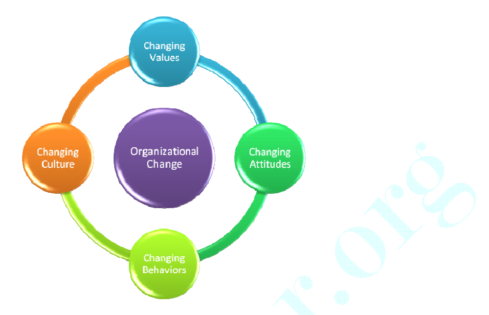
Figure.1. The cycle of organizational culture change.

1995). The socialization process is applied to not only new employees but also the old ones who should be certified formally and informally to be assigned certain tasks.