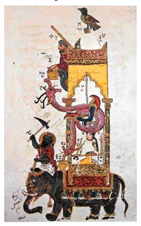
Image 3. Book of the Knowledge of Mechanical Devices (Kitab fi Ma'rifat al-Hiyal al-Handasiya) of al-Jazari: The Elephant Clock. Probably Syria, 1315, Metropolitan Museum of Art, New York.

On the other hand, literary texts such as the Maqamat with its ingenuity of eloquence, offers little to the illustrator to create a virtually relative scene to the text. Since the illustrator is not aware of what these verbal deceptions suggest, the illustrations of the Maqamat give an insight into the Arab social life, mostly informative about Iraq as they were executed there. The lively and colourful illustrations produced in 13<sup>th</sup> century Baghdad depict a variety of scenes from urban life in a style that conveys the jesting and caricatured character of the sketches. In their realism these miniatures reveal many features of medieval Arab life as this could be accepted as the expression of the sophisticated taste for art and literature among the Arab urban bourgeoisie.