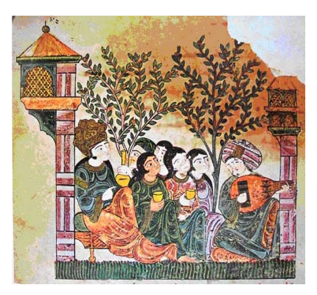
Image 6. Story of Bayad and Riyad (Hadith Bayad u Riyad): Bayad singing and playing the ud before the lady and her handmaidens. Maghrib (Spain or Morocco), 13<sup>th</sup> century. Biblioteca Apostolica, Vatican.