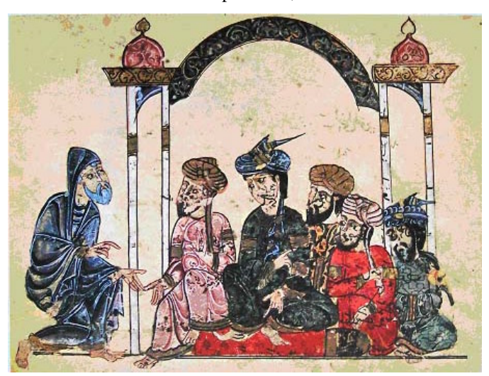
Image 7. Maqamat Hariri: Abu Zayd addresses an assembly in Najran (Forrty-second Maqama). Probably Syria, 1220, ms. Arabe 6094, Bibliotheque Nationale, Paris.

could be described as "transferring the image of an oral narrating to the surface of miniature painting as a visual depiction of the act". Besides, there are also other scenes resembling an act of oral narrating that may drive us to assume that the illustrator might have been influenced from those performances, since he was the audience, and probably in the effort to create a close depiction of what he had seen in reality as the oral narrator performs his story.