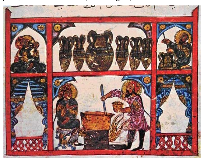
Image 4. De Materia Medica of Dioscorides: The Pharmacy, Baghdad .8Iraq), 1224. Metropolitan Museum of Art, New York

concoctions ( See Image 4 ). If we turn to the compositional setting of the scene, it is apparent that the flatness, the architectural framework and the character of the figures recalls the stage setting of a shadow play as in the Leningrad manuscript of the Maqamat, in the scene of Abu Zayd before the Cadi of Sa'da in Yemen (Thirtyseventh Maqama), dated 1225-1235 ( See Image 5 ).