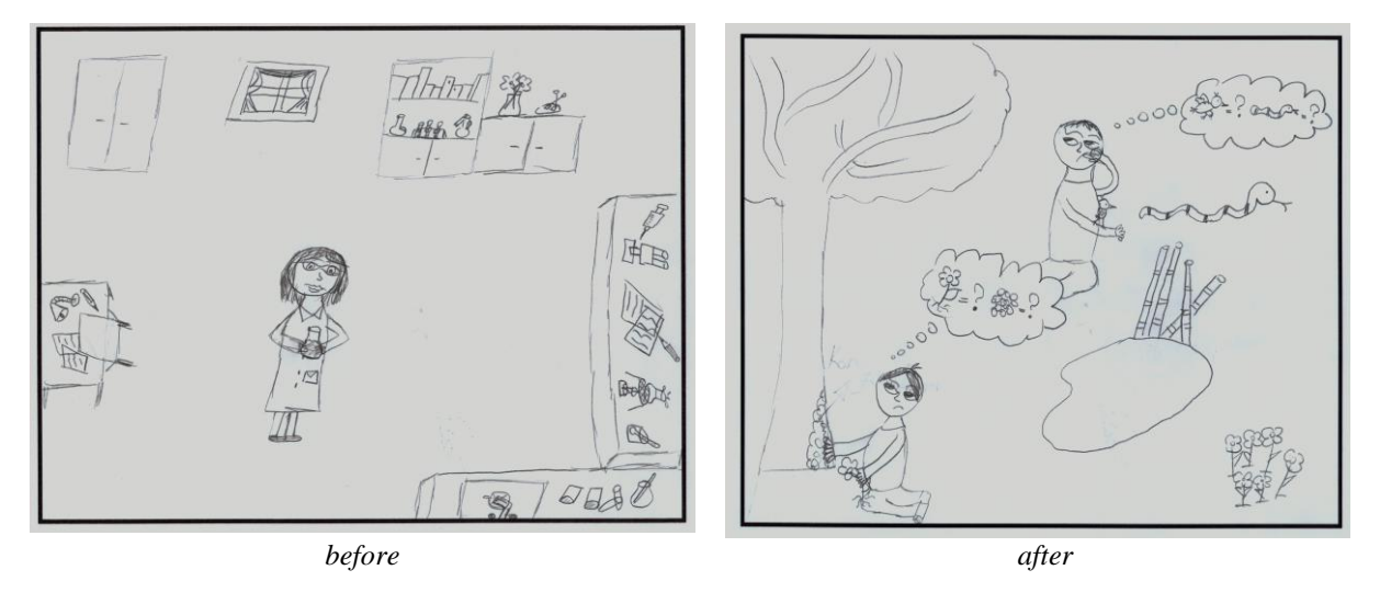
Figure 1: Drawing of student 3 before and after the application.

Figure 1 and Figure 2 shows two examples of pre and post drawings obtained by DAST during the study.