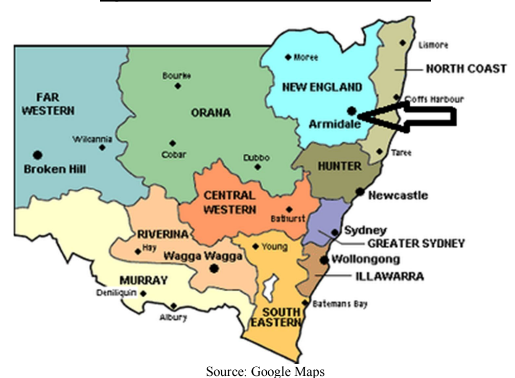
Figure 1. Location of Armidale in New South Wales

Armidale (30°30′S 151°39′E/ 30.500°S) is a city in the Northern Tablelands, New South Wales (NSW), Australia (Burr, 2002). Armidale is located on the Northern Tablelands in the New England region about midway between Sydney and Brisbane at an altitude ranging from 970 metre at the floor of the valley to 1,110 metres above sea level at the crests of the hills (Burr, 2002). Armidale has a cool temperate climate with the majority of rain falling in the summer months. Armidale's elevation results in a mild climate, with pleasant warm summers, extended spring and autumn seasons, and a long cold winter with some frosty nights. Figure 1 shows the location of Armidale in regional NSW. Generally, rural/regional Australia are rich of the following renewable energy sources such as solar, wind, geothermal, biomass and hydropower, however, further works needs to be done to prove the above findings feasibility against existing traditional electricity generation based on fossil fuel (Maklad, 2014a)