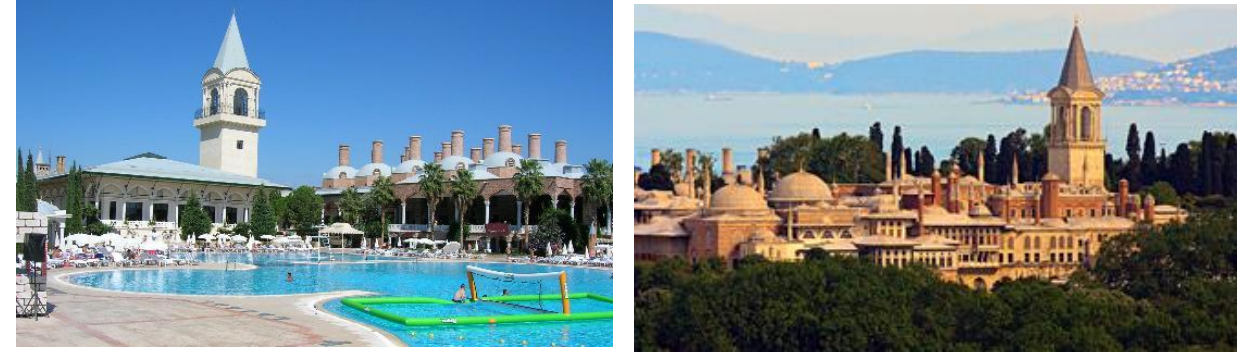
Figure 3, 4, 5, 6. Original Topkapi Palace in Istanbul (upper left), Source: www.turkeytourguide.comwp-contentuploads201204Topkap%C4%B1-Palace-Museum.jpg; Topkapi Palace World of Wonders Hotel in Antalya (upper right, lower left and right), Source: http://www.wowhotels.com/wowtopkapipalace.asp

The rest of the cases share important characteristics with each other and are different from Topkapı Palace World of Wonders in the sense that they are not exact replicas of historical buildings, but they are influenced by Ottoman or Seljuk architecture.