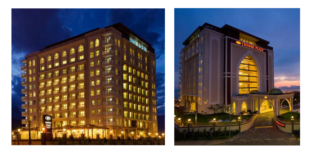
Figure 10, 11. Crowne Plaza in Antalya (left and right), Source: <u>http://www.cpantalya.com/</u>

The last case, which is Delphin Palace, carries within itself again eclectic influences, which could be likened to Ottoman and Mughal architecture. The most obvious oriental elements of the hotel are the pointed golden domes, the biggest of which is sitting at the intersection of the two blocks of the hotel. They resemble the pointed domes of Taj Mahal or Badshahi mosque. The other stylistic stereotypes are mainly found at the interior decoration, such as the excessive use of golden ornamentations, the furniture, and the carpets. When compared with the two first cases, Delphin Palace creates an orientalist atmosphere, but not that dense as the others.