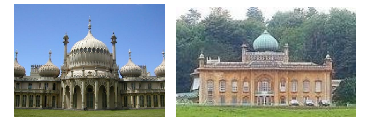
Figure 1, 2. Examples of Orientalist Architecture in Europe: Brighton Pavillion, Brighton, England (left), Source: http://en.wikipedia.org/wiki/File:Brighton_Royal_Pavilion.jpg; Sezincote House, Gloucestershire, England (right), Source: http://en.wikipedia.org/wiki/File:Sezincote_House.jpg

However, what seems as more striking in this context is that the appropriation of this stylistic attitude did not stay limited to the use and consumption of Westerners; on the contrary, the Orientals themselves also adapted it to themselves. Therefore, as asserted by Bozdoğan, the stylistic display of the Orient appears by no means as an entirely Western attitude, on the contrary the Orientals themselves have employed the orientalist images as "instant identity kits". (Bozdogan, 1988: 38-45)