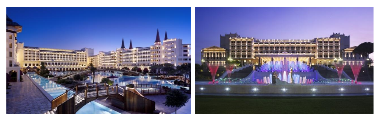
Figure 9, 10. Mardan Palace in Antalya (left and right)

Mardan Palace is a very interesting case in terms of its production, use of materials and historical references. The owner of the hotel is the Azerbaijan billionaire Telman Ismailov. It is said that Ismailov was deeply fond of his holidays in Istanbul, but he longed for the beach, so he wanted to build the replicas some of the important architectural features of the city, such as Dolmabahce Palace and Maiden Tower. A total of 1.65 billion dollars were spent on this 560 roomed hotel. In its construction, 2500 tons of gold, 500.000 crystals and 23000 tons of Italian marble were used. Even the sand of the beach, 8000 tons in total, had been brought from Egypt. All in all, the hotel was built as a luxurious pleasure palace. (Edwards, 2009)