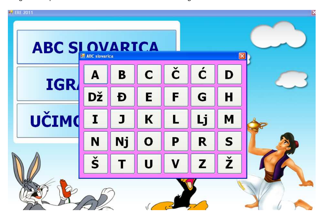
Fig 1: Screen for learning letters.

Returning back to Tuzla students continued to work on package improving and adding new functions. Now the software is tested by different experts and teachers at Educational and Rehabilitational department at Tuzla. The software package has several modules namely: learning letters, learning words, learning sounds. The design was simple and attractive for children as can be seen on Fig 1.