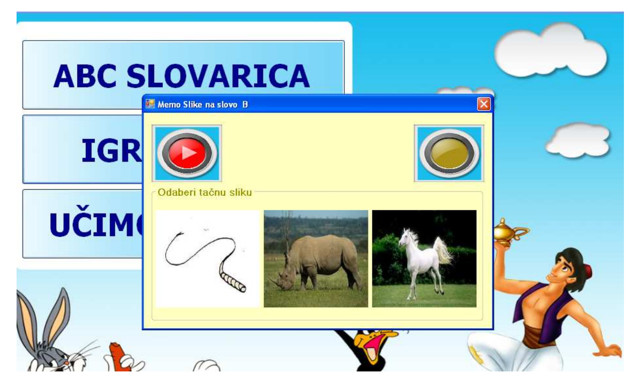
Fig 2: Learning the words.

To teach children to speak correctly for each letter there is short video presentation as it is shown on Fig. 3.