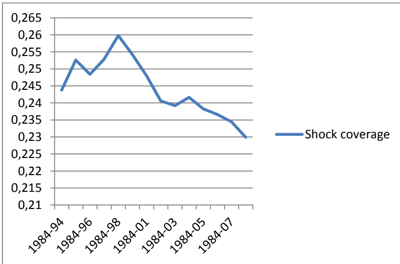
Figure 2. Shock Coverage Over Time

As previously stated, this paper aims to assess if the EMU (for the estimations provided, EA-12) has improved in terms of lowering its risk to asymmetric shocks. In the case where EMU had succeeded in doing so, for whatever the reason may be, the insurance provided by the scheme would fall. To assess this, the paper compares the results of estimations for Okun's law for various periods, starting from the 1984-1994 period until the whole 1984-2007 period is covered. As seen in the figure 2, the stabilisation provided by the scheme (the absolute value of \sigma ) has decreased over time.