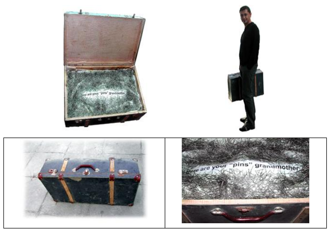
© Online Journal of Communication and Media Technologies

"Here are your pins grandmother" installation work visuals.