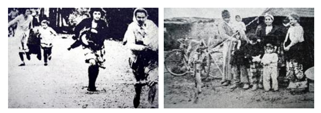
Migration and refugees of 1960's (Alasya, p.227, 1988).