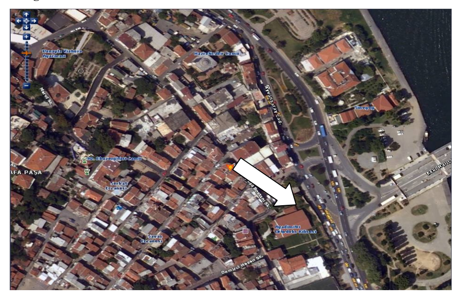
Figure 2: Zonal Location of Fatih Police Station