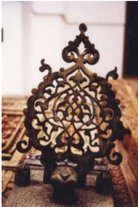
Figure 4: Detailed view of the handle part. Yasi (Turkestan), Kazakhstan,2000.