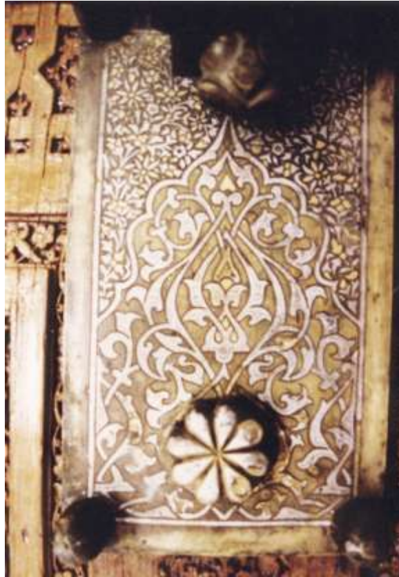
Figure 5: The flat surface of the doorknockers. Yasi (Turkestan), Kazakhstan,2000.