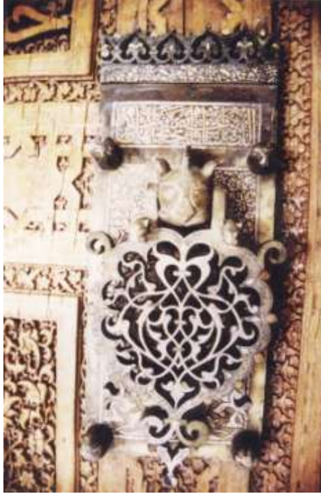
Figure 3: The doorknockers of the Khawaja Ahmad Yasavi Shrine. Crown, inscription plaque and door handle parts. Yasi (Turkestan), Kazakhstan,2000.