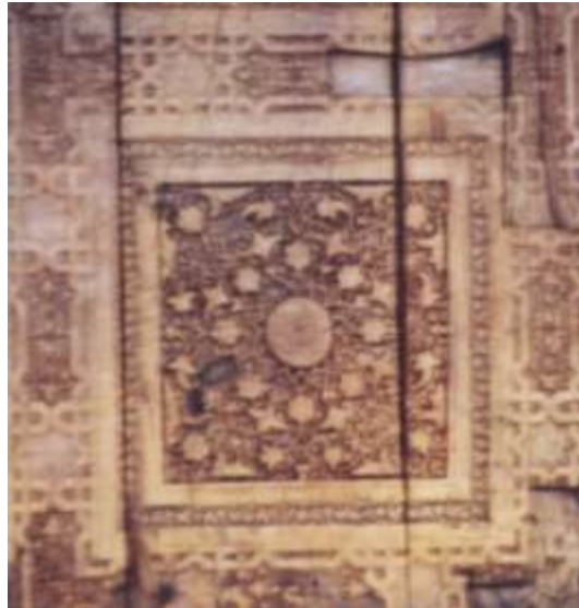
Figure 7: The eight leaved stylistic lotus design. Front panel of the main door. Khawaja Ahmad Yasavi Shrine . Yasi (Turkestan), Kazakhstan. (Tekin 2000)