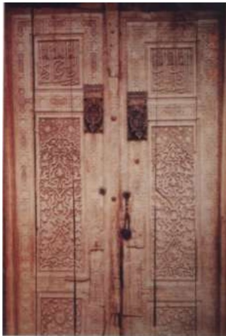
Figure 2: The front panels of the the main door. Yasi (Turkestan) (Nurmuhammedoğlu 1993)