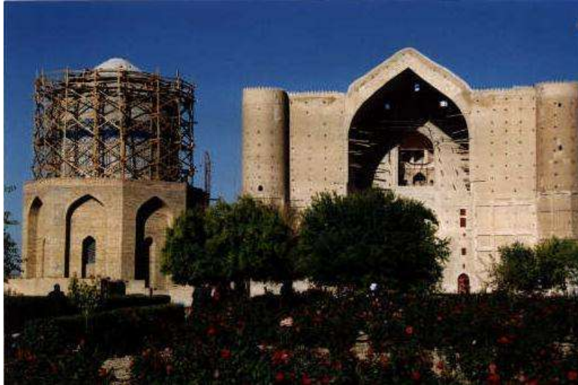
Figure 1: Khawaja Ahmad Yasawi Shrine. Yasi (Turkestan), Kazakhstan,2000.