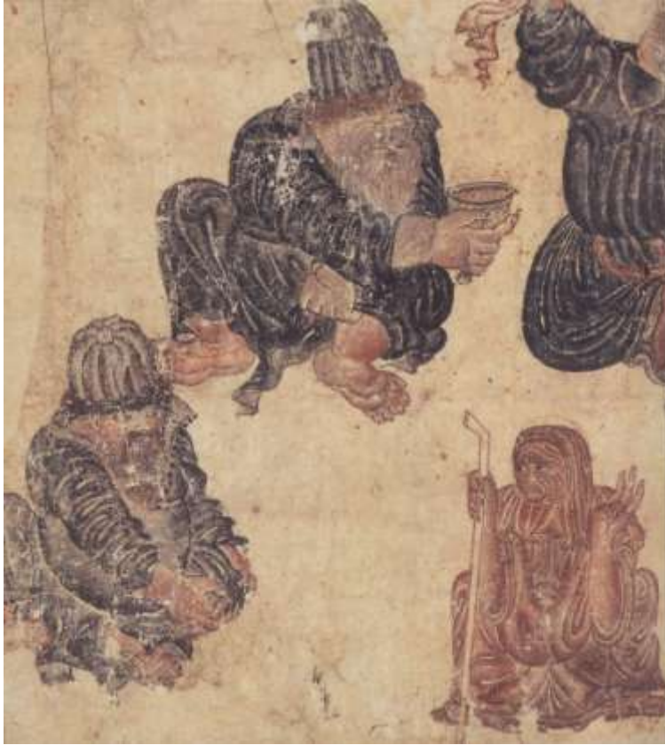
Figure 6: Mehmed Siyah Qalam. Album. Topkapı Palace Museum, H.2153, fol. 29r. (İpşiroğlu 1985:31)