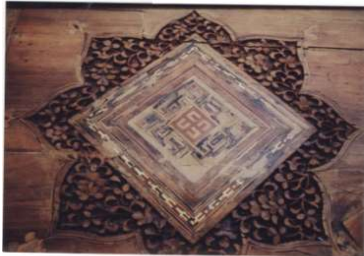
Figure 9: The swastika design on the the back panel . Khawaja Ahmad Yasavi Shrine main door. Yasi (Turkestan), Kazakhstan. Author's photograph. (Tekin 2000)