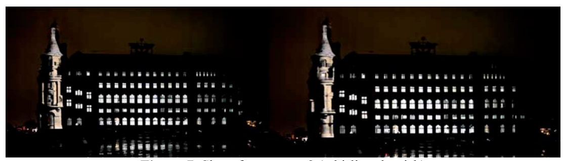
Figure 7. Shots from scene 8 (whirling dervish)

Towards the end of the show, Haydarpasa Station tower is resembled a whirling dervishes and rotated in a slow sound effects. Istanbul transforms so far calm place after its complicated and exuberant moments.