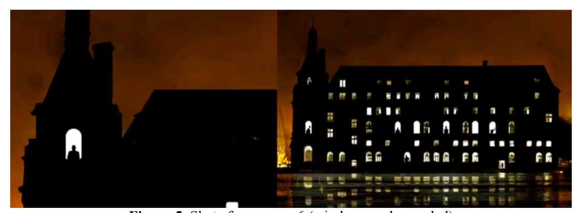
Figure 5. Shots from scene 6 (windows and crowded)

Increasing migration from the year 1950 the city of Istanbul in different cultures, life values, requirements are changed. Creating people silhouettes to emphasize the station's windows state this description. Istanbul's complex structure is edited with auditory sounds such as traffic sounds and human sounds.