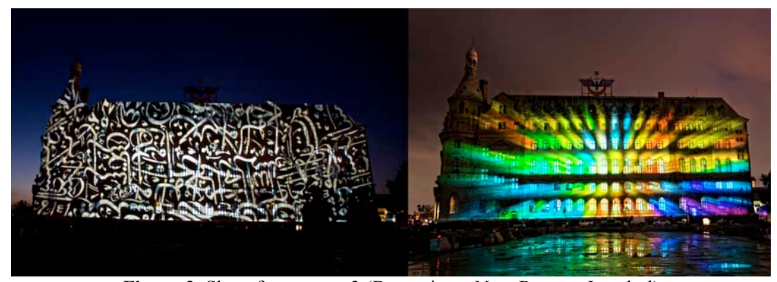
Figure 2. Shots from scene 3 (Byzantine – New Rome – Istanbul)

This process of reflecting advances in a linear time. The images of the period of Istanbul's conquer such as ships going into the Bosphorus; destroyed walls are visualized with sound elements. On the other hand, the aesthetics of Ottoman are shown by "Calligraphic art" to the audiences.