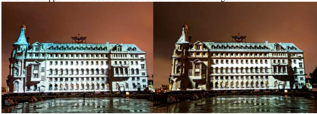
Figure 4. Shots from scene 5 (bridge, migration and wagons)

The importance of the train station is improved with the conjunction of two contents by narrating with the movements of wagons that appears in the middle of the facade. The existing identity of Haydarpasa is visualized with the movements of the wagons. This movements support with the sound of the train and narrate the migration.