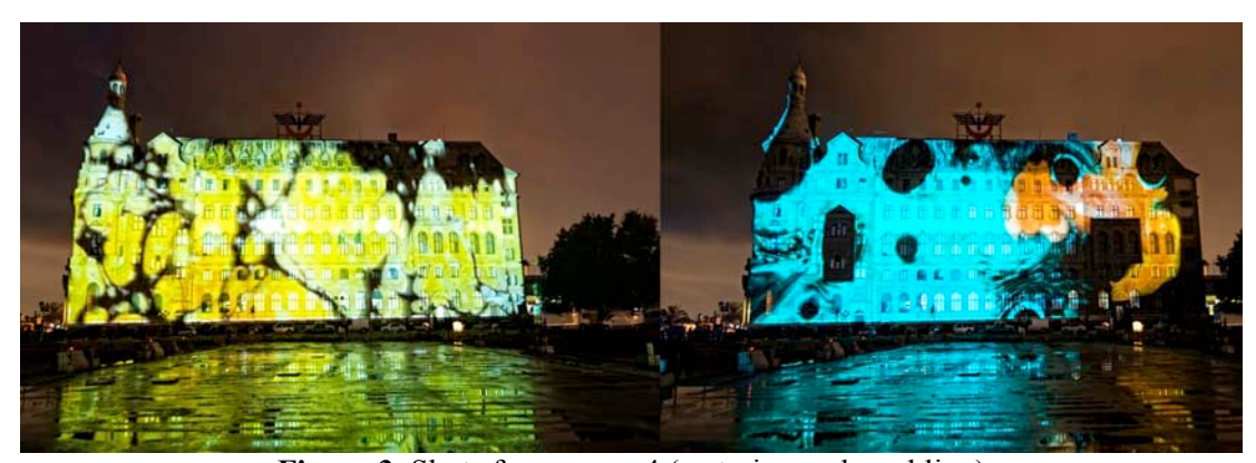
Figure 3. Shots from scene 4 (watering and marbling)

Art is also the element, which has come with history apart from religion and language. The visuals of Marbling on the facade interact with the audiences at the same time with the surface of the sea that composes a strong process.