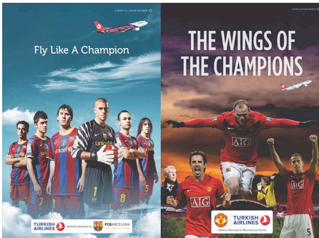
Figure 1: Turkish Airlines Posters of Barcelona and Manchester United

2010 season with 6 cups, and is to fly with Turkish Airlines to all Champion's League and other official tournaments for the next three years.