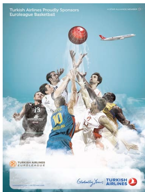
Figure 4: Turkish Airlines Posters of Euroleague