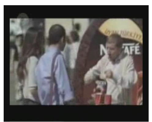
Figure 3. Demonstration and service of the product in the Nescafé advertisement

It was noticed that two male participants criticized the format and the strategy of the Nescafé commercial in an implicit way: