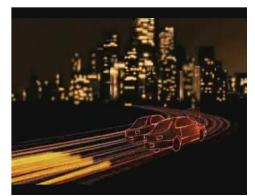
Figure 10. A scene from the city in Honda advertisement

"When drank the feeling of happiness, smile and craving." (male) "Positive mood alteration, relaxing, cheering up." (male) "Wescafé is the source of joy." (male)