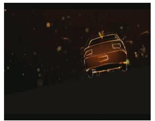
Figure 12. The display of car in Honda advertisement

"The idea of using Honda during the childhood and youth as well as her old age has come close to me as someone who loves stability." (male)