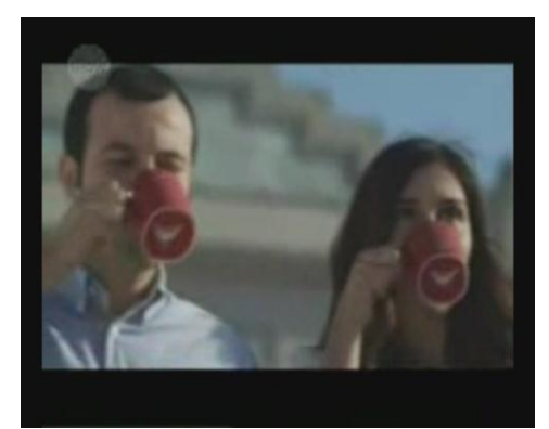
Figure 4. Consumption of product in the Nescafé advertisement

"The moment of pouring water makes me drink coffee." (male)