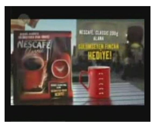
Figure 6. The present of Nescafé