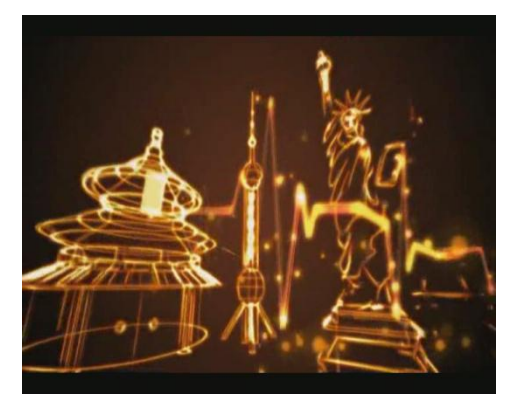
Figure 2. Various Visual Components in Honda advertisement

In the Honda advertisement, a slice of life is presented. A heart beat is displayed in a sudden and it continues till the end. Many different visual components -The Statue of Liberty, Eiffel Tower, a woman and a man with a glass in their hands, a road, trees on the road, a gazelle, the car is passing fast, skyscrapers are seen, the world which has blue seas and green nature is viewed from the space - were used (Figure 2). In this frame, the longstanding label is underlined. Moreover, the life is presented with the city lights within the frame of the globosity of the label which is emphasized in the commercial. In Honda advertisement, the high-paced Honda commercial is totally animated, and made up entirely of a series of graphics/drawings rather than real life situations.