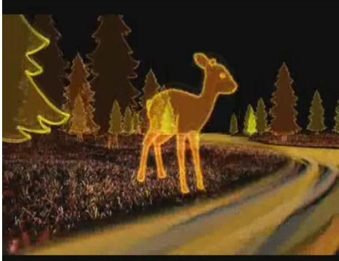
Figure 8. Various visual components in Honda advertisement

In this frame, it was noticed that most of female participants interpreted advertisements in the similar ways.