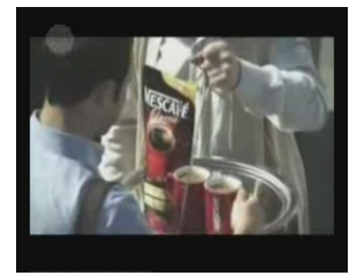
Figure 9. The service of product in the Nescafé advertisement

"The label itself" (male) "The cup of coffee" (male) "Questioning the Nescafé booth in the port" (male) "I found it ironic that a man from Black Sea region suggests coffee instead of tea." (male) "Practicality and sincerity of Black Sea people" (male) "Nescafé brand and its package ... sea side" (male)