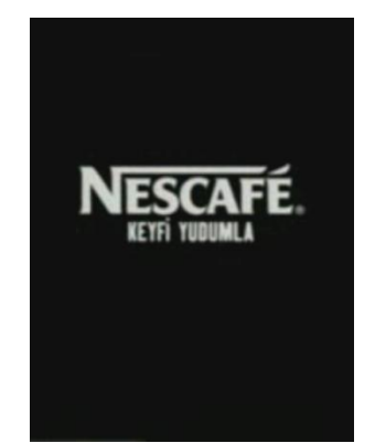
Figure 1. The motto of Nescafé