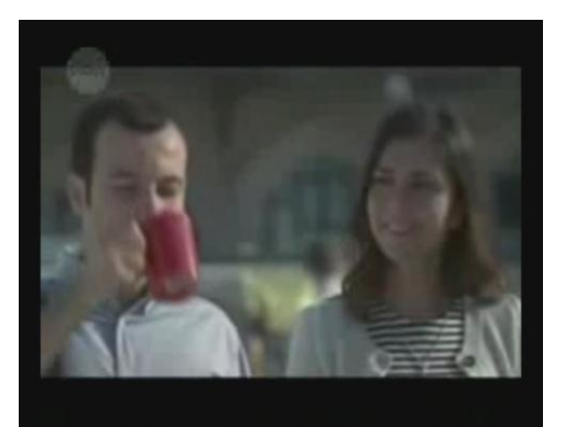
Figure 7. Consumption of product in the Nescafé advertisement

"joy and happiness" (female) "3.5 minutes break: Nescafé" (female)