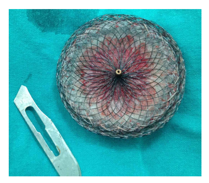
Figure 2. Removed Amplatzer septal occluder device.