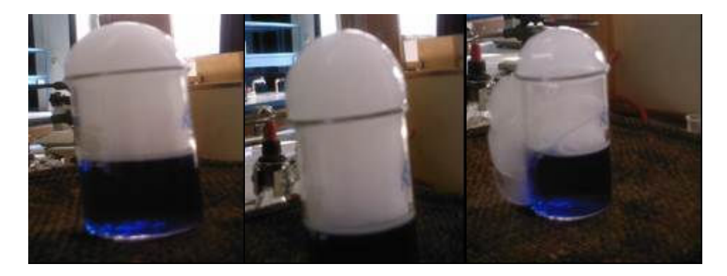
Figure 3. Pictures of the demonstration.

Performing the demonstration: A 200 mL solution was prepared using a surfactant (common liquid soap). The surfactant was used to reduce the surface tension of the solution to produce bubbles. The solution was heated to 40-50 ^{\circ} C to accelerate the process. A piece of dry ice was added to this mixture. Dry ice changes its phase from solid to gas by forming a bubble on the top of the beaker. When the pressure of CO<sub>2</sub> (g) exceeds the surface tension of the surfactant, the bubble bursts (Fig. 3). In our demonstration, we used dry ice that had been produced in our laboratory. The demonstration lasted in approximately 3 minutes.