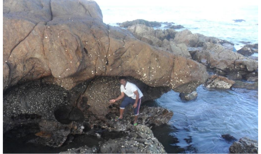
Figure 4. Sample collection

in Raymont et al. , (1964); Duboid et al. , (1956) and Folch et al. , (1956) for the protein, carbohydrate and lipid respectively.