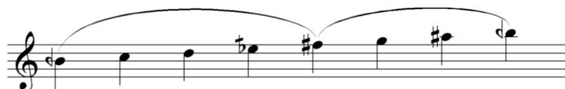
Fig. 5. The first scale of the Maqam Hüzam on the pitch Segâh.

Melodic contour can be defined more appropriately for the movements of the maqam-s, and it can be used as a term in common terminology instead of seyir or musical direction. Some of the examples from Turkish art music theory and the works may be more explanatory for the existence of the maqam-s. Below are given the scales of the Maqam Hüzam according to Arel-Ezgi-Uzdilek theory in Turkish art music (Arel, 1991: 264-265).