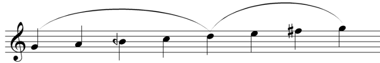
Fig. 1. The scale of the Maqam Rast on the pitch G (Rast) by combination of Rast pentachord and tetrachord in Turkish art music.

This simple description includes only the pitches and their cycle, and it exists thanks to many works and performances. However, these depends on the composer’s and performer’s perception and experience. Because maqam music spreads from ear to ear and is based on experience within the framework of a master and an apprentice relationship called meşk (meshq) . It is the traditional oral and experiential teaching method of maqam music (See Behar, 1993). The Western style maqam theories show that maqam is a scale, but traditional maqam music theory explains that maqam is a melodic cycle of the pitches and melodic nuclei. This situation is a dilemma between abstractness and concreteness of maqam. Below are the scales of the Maqam Rast according to the Western style maqam music theory: